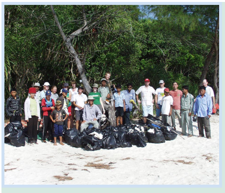
Frontier-Cambodia staff and volunteers with local community helpers after all their hard work cleaning up the beach.