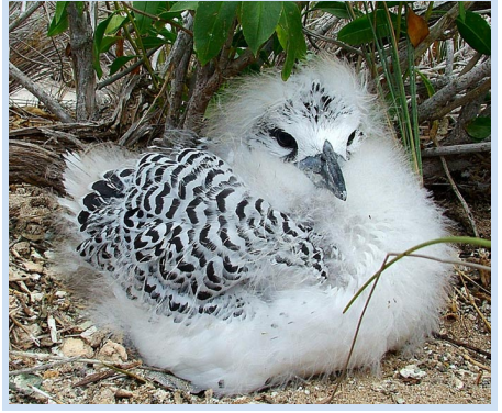
Red tailed tropic bird chicks are threatened by rat infestations and human disturbance

working with several institutions for the last five years to make a positive contribution to conservation activities in the South West of Madagascar. Recent completion of this work has heralded our move to areas designated by the Malagasy government as major conservation priorities in the northern region of Antsiranana, also known as Diego-Suarez. Frontier-Madagascar's research activities, both terrestrial and marine, will aim to provide regional authorities with baseline ecological and resource-use information that will prove essential in the establishment of a sustainable development scheme for the region.