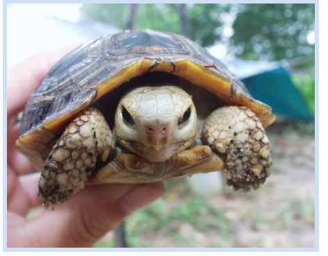
Frontier-Cambodia confirmed the presence of the endangered elongated tortoise Indotestudo elongata in Ream.

Frontier-Cambodia has now embarked on an exciting new research project in the little studied Botum Sakor National Park, one of the Protected Areas in the Cardamom Mountains Priority Landscape on the south-west border of Cambodia. This new project has great potential, as a great diversity of habitats have already been reported, including extensive lowland, mangrove and swamp forests, potentially harbouring the complete assemblage of Cambodian fauna including large carnivores. Excitingly, tracks and signs have indicated the presence of sun-bear Helarctos malayanus , elephant, large deer and leopard cat Felis bengalensis , and there are even rumours of tiger and leopard in the park.