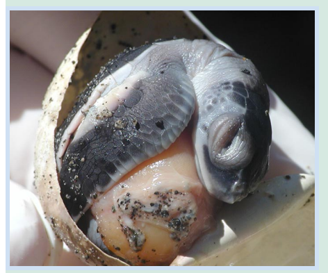
Examining turtle eggs to determine why hatching did not occur is vital to develop and improve hatcheries.