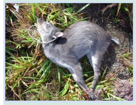
Victims of poaching in forest reserves include this snared blue duiker Cephalophus monticolor.

The Forgotten Forests of Mtwara - A Reconnaissance to Prioritise Biological Knowledge for