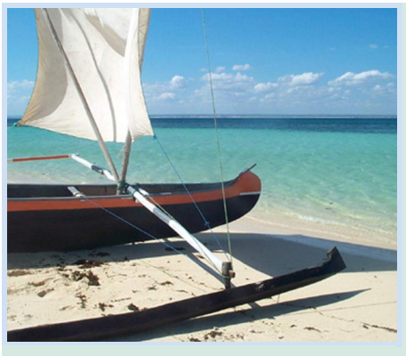
Pirogue (fishing boat) in Madagascar.