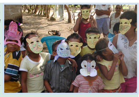
Children wearing animal masks they made themselves with the help of Frontier-Nicaragua staff and volunteers.

Making Masks in Nicaragua: Environmental education projects were initiated in the remote and impoverished communities of Salinas Grandes on the Pacific north-west coast of Nicaragua, near the protected area of Isla Juan Venado. Frontier-Nicaragua worked with teachers and community leaders to visit schools from the villages of Villa Esperanza, Divino Nino and Omar Torijo. Classes for primary school children included novelty games and ideas, making animal masks, painting maps, and playing ball games to help teach basic concepts about wildlife and the protected area of Isla Juan Venado. Both the children and volunteers thoroughly enjoyed themselves and this initiative will continue to be a regular feature of the work programme.