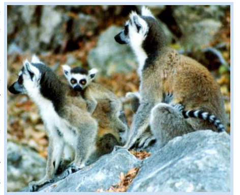
The endangered ring-tailed lemurs, Lemur catta, are threatened by hunting as they are regarded as a source of protein.

verreauxi, threatened by excessive hunting. Other mammals documented include the Malagasy mongoose Mungotictis decemlineata, a species that may be endemic to the region. Among the 125 species of bird identified, five are vulnerable or near threatened species; including the regionally endemic long-tailed ground roller Uratelornis chimaera and Madagascan crested ibis Lophotibis cristata. In addition, possible new species of Monomorium ant and Hisperid butterfly are awaiting identification. Finally the project revealed that conservation efforts should consider the area as an ecological landscape rather than focusing on individual habitat types. The new Wilderness Programme in northern Madagascar has initiated collaborations with S.A.G.E (Service d'Appui de Gestion de l'Environnement; a local NGO acting as a facilitator for the development of community-based natural resource management projects), and started in-depth biological surveys in the forest covering the Montagne de Français. This dense primary deciduous forest is rich in wildlife but has been little-studied, and our biodiversity survey results will feed into conservation initiatives and strategies for the area.