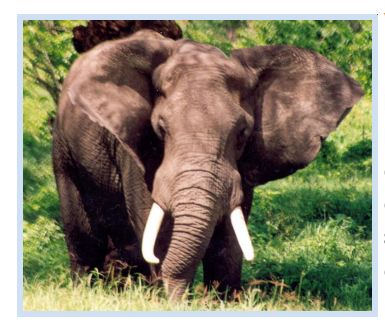
The African elephant Loxodonta africana is often a source of human-wildlife conflict.

resources are threatened by a growing population and the need for social and economic development. Since 1989 Frontier-Tanzania has been operating across the country's varying biomes, accumulating the ecological knowledge necessary for successful environmental conservation and sustainable development. Throughout this time Frontier-Tanzania has run Marine, Forest and Savanna projects, with the 1995 gazetting of the Mafia Island Marine Park resulting from our survey work being just one example of many notable successes.