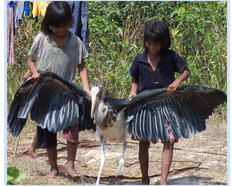
The vulnerable lesser adjutant is often kept as a pet in local communities.

populated forest remain. These forests form part of one of the world's most extensive protected area networks, yet are both poorly surveyed and increasingly under threat from human activity. Frontier-Cambodia's Tropical Forest Research Programme is well into its second year, having recently completed the surveying of Ream National Park in the south of the country, with many exciting and significant findings.