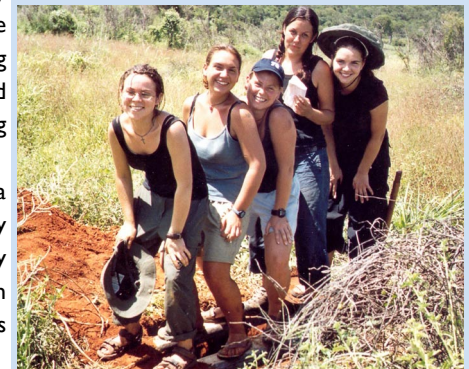
Trekking to trap-sites in the Tanzanian wilderness.

These are just a few snapshots of my days on my ten week Frontier expedition in Tanzania which provided me with such a great experience both personally and in gaining necessary conservation knowledge and skills. Having worked with Frontier I am now developing my career within conservation and I am working as a volunteer for the Wildlife Conservation Research Unit in Oxford, helping to reintroduce endangered Water Voles back into Oxford's wildlife which, so far has been very successful!