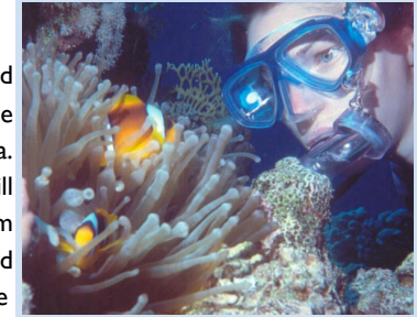
Marine surveys include reef fish inventories.

Searching for dugongs: Drawing on the success of previous marine projects such as Mafia Island and Misali Island in the Zanzibar archipelago, we are now initiating our new Marine Programme in the Mtwara region, on the outskirts of the Mnazi Bay-Ruvuma Estuary Marine Park in southern Tanzania. Frontier-Tanzania last conducted marine research in Mtwara in 1998, and further research here will enable us to determine the ecological trends in the intervening years, such as changes resulting from human impacts, global climate change, coral bleaching events and the recent tsunami. Surveys will record the wealth of biodiversity, with seahorses, sea turtles, large pelagic fish such as sailfish, and even the rare and elusive dugong rumoured to be present.