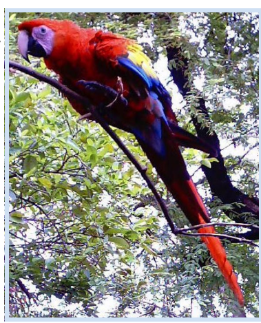
Scarlet macaws are threatened by the trade in endangered species.

In the coming months Frontier-Nicaragua will be working in Isla Juan Venado and Estero Padre Ramos, protected areas in the north-west region; continuing turtle conservation on the beaches and biodiversity surveys in the mangroves and tropical forests of Nicaragua.