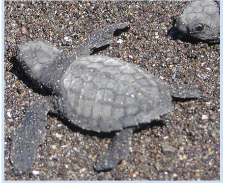
Olive ridley hatchlings are preyed on by crabs and birds as they make their way to the ocean.

despite representing only 0.5% of the globe's land surface. Nicaragua shares the same rich biodiversity as many of its neighbours, yet it has often been overlooked on the international conservation agenda. Recognising the conservation potential in the country, Frontier-Nicaragua was established and the first year of the Coastal and Tropical Forest Research Programme has been a real success, with several grassroots initiatives working closely with the local people to address conservation priorities in the Pacific north-west region.